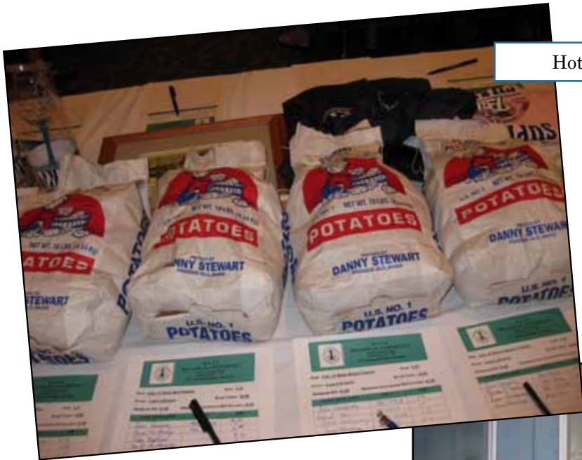
Hot Potato Auction